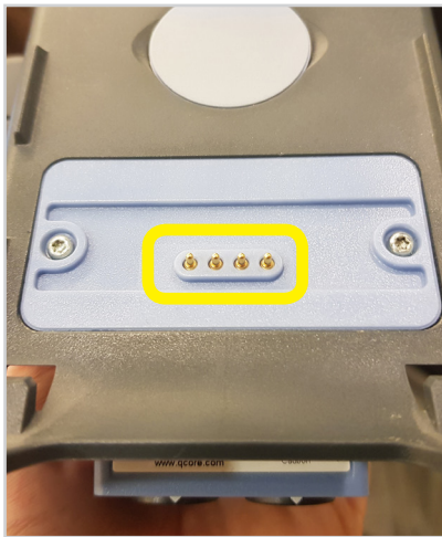
Mini Cradle with Splitter