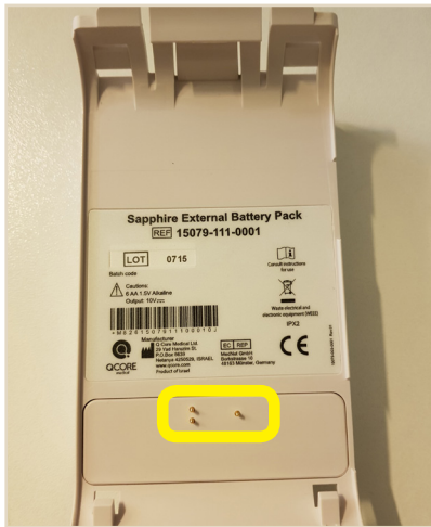
Sapphire External Battery Pack